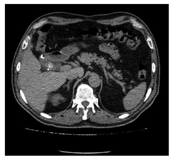
Figure 1. Abdominal CT axial plan – remnant gall-bladder stone

tectomy surgery due to poor visualization of the anatomy of the cystic duct and gallbladder junction for reasons such as hemorrhage, adhesion, or inflammation. Partial cholecystectomy is more common in cholecystectomy which is performed after acute cholecystitis [3, 4].